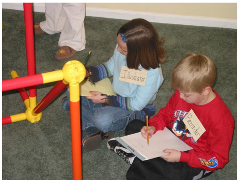
The Illustrator (left) and the Recorder (right) must pay close attention to record every detailed step.

Back row (left to right): Coordinator, Designer Front row (left to right): Illustrator, Designer, and Recorder. All are working to develop "how-to" instructions.